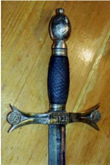
Sword of Nuada*

presumably by Gardner himself, to be more in keeping with the rituals and symbols of Witchcraft.